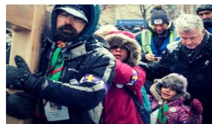
TOGETHER IN ACTION 2019