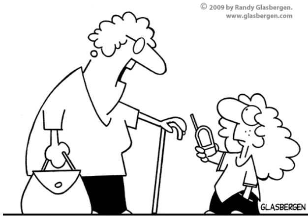
"Wireless communication is nothing new. I've been praying for 75 years!"