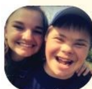
BETWEEN FRIENDS ADVENTURES

Our vision is that all children and families have equitable access to community supports and services. We are very thankful for the assistance to provide parenting education that reduces child neglect and abuse to ensure the healthy growth of children and families.