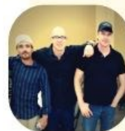
ST. DISMAS PRISON SOCIETY

Thank you for seeing the value in giving adults with disabilities an opportunity to have adventures and make friends in an environment where they feel safe and accepted. Your gift enriches the lives of so many unique individuals who bond and grow at our programs.