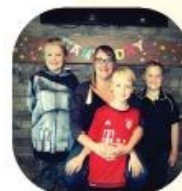
CATHOLIC FAMILY SERVICE

St. Dismas helps with prisoner reintegration and aftercare programs, services and support. With your generosity, we have changed lives, healed communities and expanded our outreach and effectiveness. Together we have been a part of answering Jesus' call in Luke 15 to help return the lost sheep to the flock. Thank you!