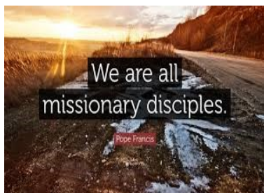
Called to Serve