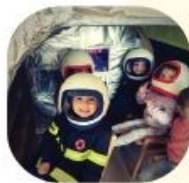
FORT MACLEOD KIDS FIRST FAMILY CENTRE

Our vision is that all children and families have equitable access to community supports and services. We are very thankful for the assistance to provide parenting education that reduces child neglect and abuse to ensure the healthy growth of children and families.