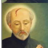
St. Issac Jogues