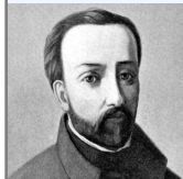
St. Gabriel Lalement