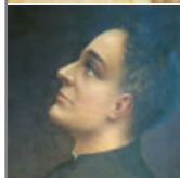
St. Charles Garnier