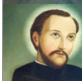
St. Noel Chabanel