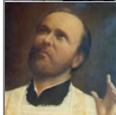
St. Anthony Daniel