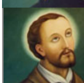
St. Jean de Lalande